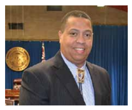
Wuneekeesuq Nutawâm (Greetings to my Tribal Community),

This is a beautiful time for our people. I am so proud of our Tribe and the positive momentum we are displaying in all aspects of our Tribal life. We are pursuing our goals and making progress toward a very bright future for our Tribal family, and I'd like to thank everyone who has been a part of our success. In particular, there have been many very successful events for our Tribe recently that deserve recognition.